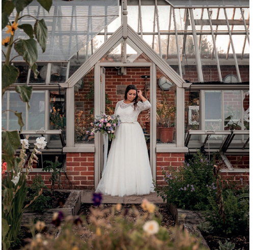
Flowers: Wild Botanicals Floral Design